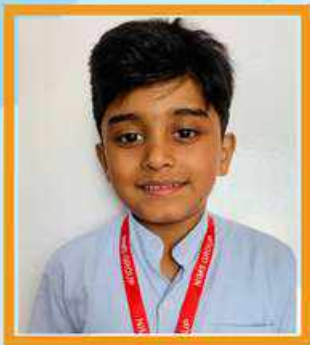
EHAN HAMIZ KG 2- K